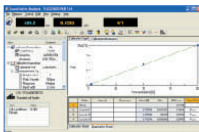
Spectra Manager II (Spectra measurement)

A full complement of accessories is available to optimize the V-650 for particular applications. Options include a wide variety of liquid cell holders, micro cell holders, flow cell units and accessories for solid samples. Advanced accessories such as automated cell changers, sippers and programmable temperature control systems allow full control by the iRM or Spectra Manager II.